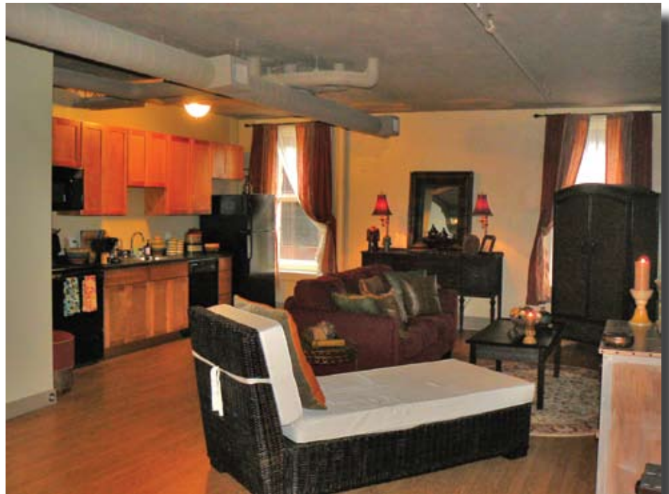
Residence of Mackenzie Stroman, one of the first tenants in the Masonic Lofts.

indicated that demand would support the development of 300 units of live/work space in downtown Syracuse. They recommended an initial test of the market with a project containing between 25 and 40 units, in a building totaling about 50,000 square feet. Based on the performance of the initial test, they felt subsequent developments could be undertaken.